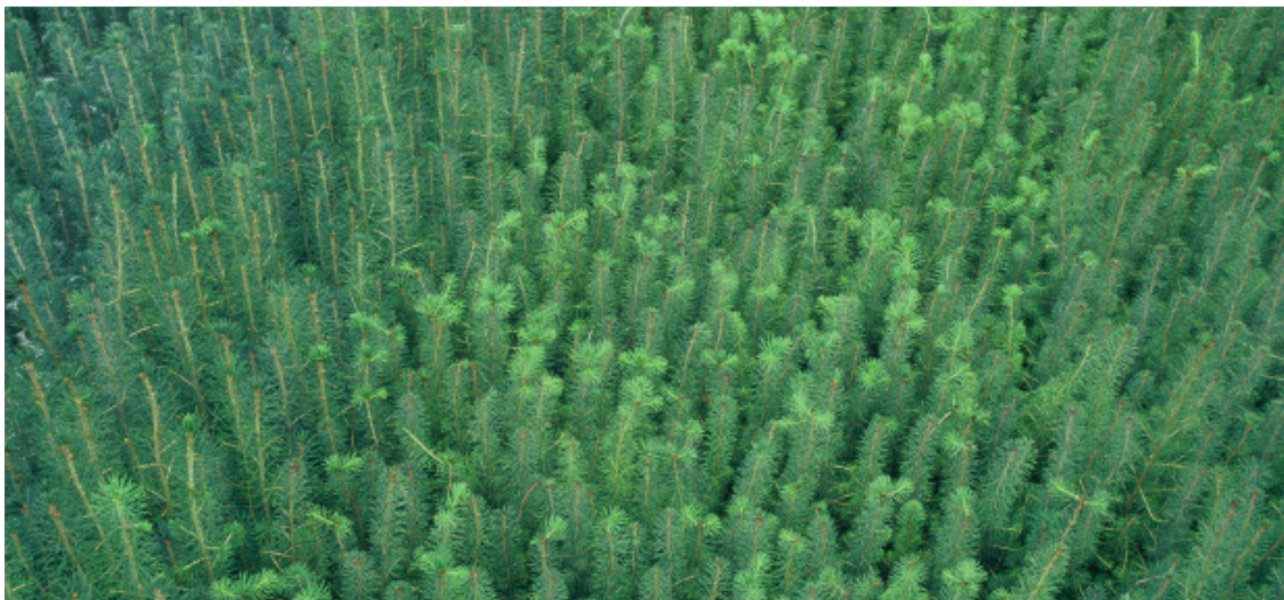
Photograph from "The Forests of Canada" collection, Natural Resources Canada, Canadian Forest Services, 2003.